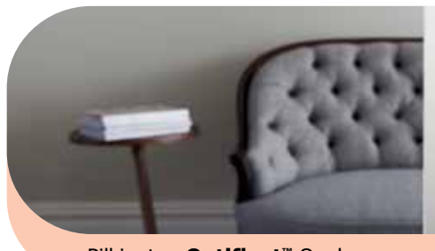
Pilkington Optifloat ™ Opal