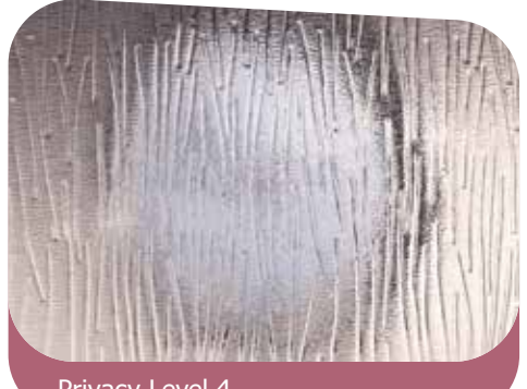
Privacy Level 4