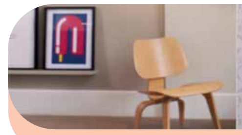
Canterbury ™ Opal